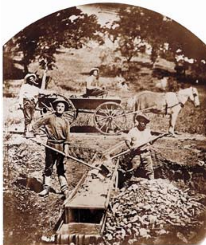
▲ These miners are prospecting in Spanish Flat, California, in 1852.

GOLD RUSH BRINGS DIVERSITY By 1849, California’s population exceeded 100,000. The Chinese were the largest group to come from overseas. Free blacks also came by the hundreds, and many struck it rich. By 1855, the wealthiest African Americans in the country were living in California. The fast-growing population included large numbers of Mexicans as well. The California demographic mix also included slaves—that is until a constitutional convention in 1849 drew up a state constitution that outlawed slavery.