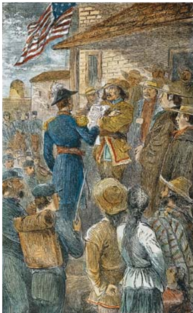
▲ This 19th-century wood engraving shows Colonel Stephen Kearny capturing Santa Fe, New Mexico.

THE WAR IN MEXICO For American troops in Mexico, one military victory followed another. Though Mexican soldiers gallantly defended their own soil, their army labored under poor leadership. In contrast, U.S. soldiers served under some of the nation's best officers, such as Captain Robert E. Lee and Captain Ulysses S. Grant, both West Point graduates.