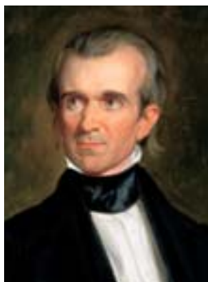
▲ James Polk, also known as “Polk the Purposeful”

Polk now believed that war with Mexico would bring not only Texas but also New Mexico and California into the Union. The president supported Texas’s claims in disputes with Mexico over the Texas-Mexico border. While Texas insisted that its southern border extended to the Rio Grande, Mexico insisted that Texas’s border stopped at the Nueces River, 100 miles northeast of the Rio Grande.